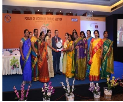
Third Prize : NLC