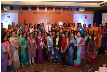
First Prize : IOCL