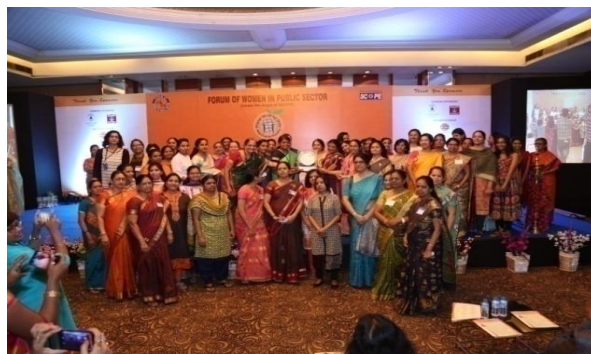
Third Prize : NPCI

Recognition for WIPS Activities awards were given to CSL, CMPDIL, HPCL, KIOCL, MMTTC, WCL and MDL.