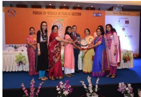
First Prize : BCCL