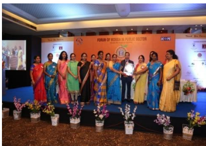
First Prize : RINL