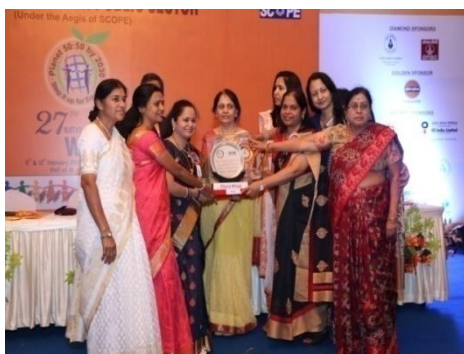
Third Prize : RCF