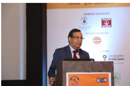
Key note address