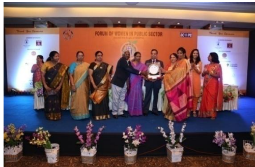
Second Prize : CPCL