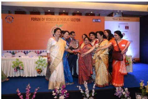
First Prize : ECL