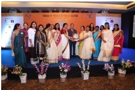
Second Prize : SECL