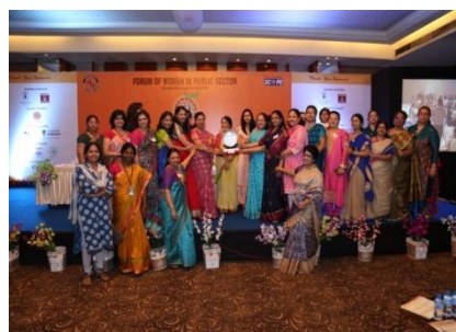
Second Prize : ONGC