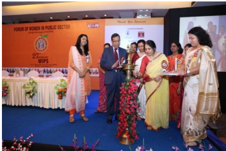
Lighting of Lamp

The theme for the meet was “Planet 50-50 by 2030 : Step it up for Equality” . The aim of the meet was to re-align ourselves to the gender balance challenge. National Meet was attended by around 700 WIPS members all over India.