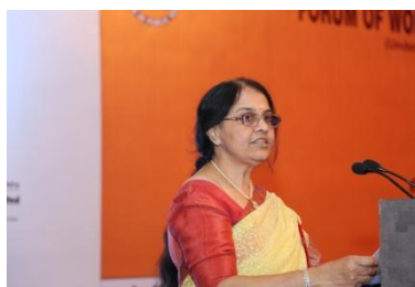
Inagural Address by Chief Guest