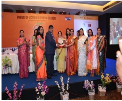
Third Prize : SCI