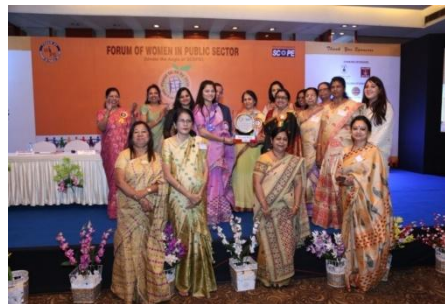
Second Prize : OIL